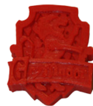
The finished crest