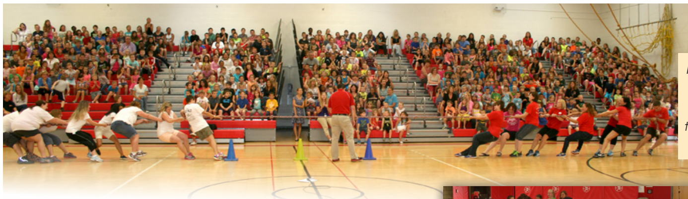
It's the white team versus the red team