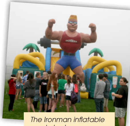
The Ironman inflatable obstacle course