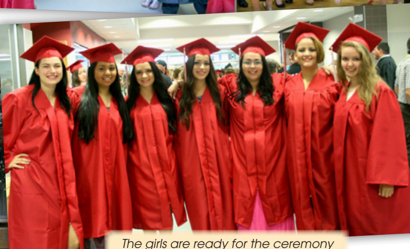
The girls are ready for the ceremony