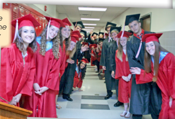
Seniors line up before the ceremony