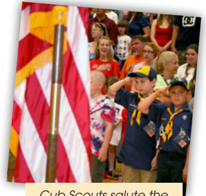
Cub Scouts salute the flag and recite the Pledge of Allegiance