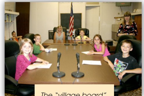
The "village board" is in session