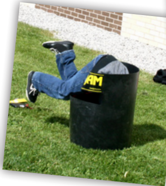
A new way to play Kan Jam