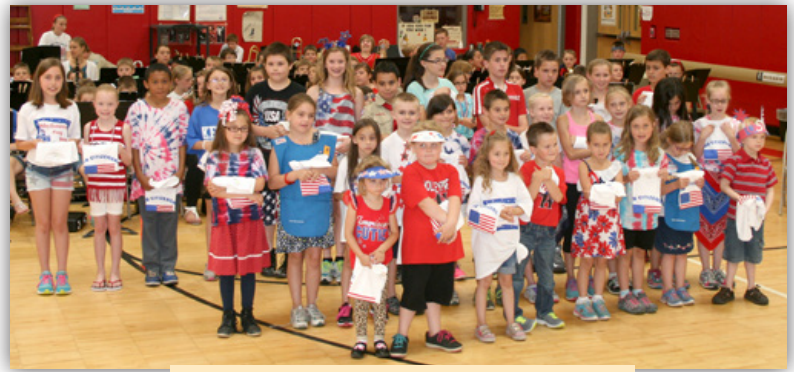
All the Good Citizen Award winners