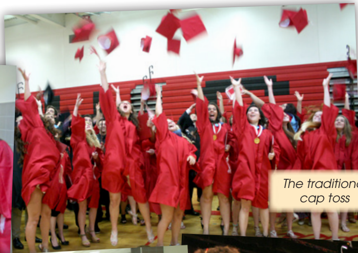
The traditional cap toss